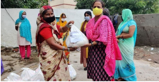
Figure 2. Volunteering by Women Association leaders and members: Asha Centre in Seelampur