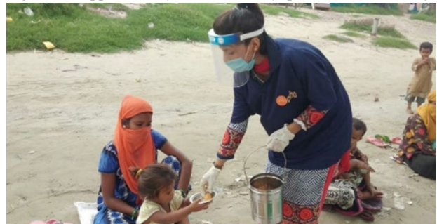
Figure 3. Supplementary Nutrition: Mayapuri slum community

Asha works among approximately 700,000 slum dwellers. The Asha team and warriors went to every house and lane to educate regarding COVID-19 and screened using infrared thermometers and pulse oximeters. If they found a person having flu-like symptoms, they immediately referred them to the nearest COVID-19 testing centre. Individuals who tested positive were assessed for clinical conditions, the severity of illness, and co-morbidities. The Asha teams referred the patients with suggestive symptoms to designated testing centers in government hospitals, community clinics, and to mobile clinics. The COVID-19 tests were and are being done free of charge, paid for by the government of Delhi.