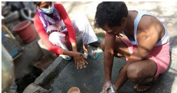
Figure 1. Handwashing instruction in the Kalkaji slum community

On 24th March 2020, the Government of India overnight shut down the country in an attempt to curb the spread of COVID-19. This had an immediate catastrophic impact on those living in the slums. The poorest of the poor, these people were mostly dependent on daily wage work to survive. No work in the community meant no money and the possibility of starvation within days. In some of the Asha slums, there was a substantial migration because everyone lost jobs. The migration had other effects such as mental stress in the slum dwellers who decided to stay on. How would they survive? If they decided to go away, theirs was also an uncertain future. The Asha team continuously counselled the families to stay put. Ignorance and fear of COVID-19 was also rampant. Because of the population density, social distancing was impossible. While the Government subsequently set up “feeding stations,” these were on the outskirts of the slums and were largely inaccessible to the weakest in the slums. The Asha team knew they had to react immediately to stave off a humanitarian disaster in slum dwellers at higher risk because they were unable to socially distance, lacked access to masks and water for washing, and needed education in behavioral practices to lessen their exposure to COVID-19. (Figure 1)